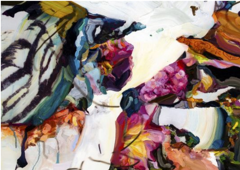
Jimmy Baker's "Arrangement 1," oil paint and UV digital ink on panel.

(http://www.cbsnews.com/news/an-epic-search-for-americas-undiscovered-artists/)