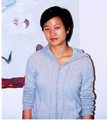
Artist Yuh-Shioh Wong at the opening of "Despite the Sun" at Foxy Production, Oct. 23, 2004