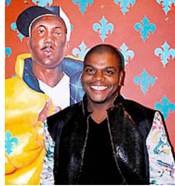
Painter Kehinde Wiley with his work in "Glory, Glamour and Gold"