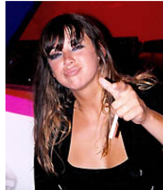
Singer Chan Marshall (a.k.a. Cat Power) at Canada, Sept. 9, 2004