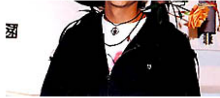
Artist and actor Yusuke Iseya at Plum Blossoms Gallery, Sept. 14, 2004