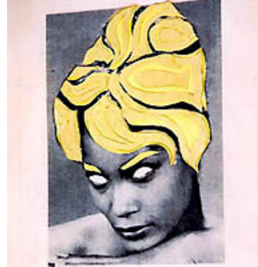
Detail from one of Ellen Gallagher's paintings at Gagosian