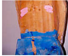
One of Georg Baselitz' sculptures