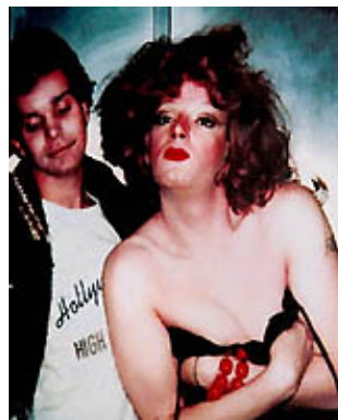
Craig B. Highberger's ca. 1974 photograph of Jackie Curtis in "Glory, Glamour and Gold"