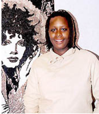
Artist Mickalene Thomas with her beaded portrait of Jackie Curtis at the Proposition