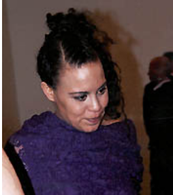
Ellen Gallagher at Gagosian Gallery, Sept. 14, 2004