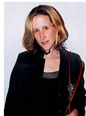
Bellwether photographer Corinne May Botz