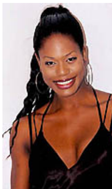
Actress Laverne Cox at the Proposition