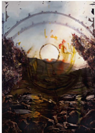
Jimmy Baker, Double Tillman , 2011, Contemporary Art Center, Cincinnati