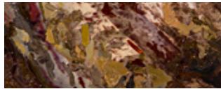
Jimmy Baker, Double Tillman (detail), 2011, Contemporary Art Center, Cincinnati