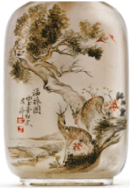
Ding Erzong Inside Painted Crystal Snuff Bottle, 1901 2.6 in. high

Before buying or selling, consult the artnet Price Database. Subscribe now.