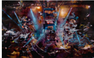
Jimmy Baker, Divination , 2011, Contemporary Art Center, Cincinnati