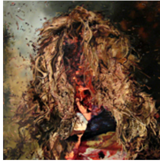
Jimmy Baker, Ghillie RP , 2011, Contemporary Art Center, Cincinnati

pixilated surfaces juxtaposed with photorealistic details of futuristic machinery.